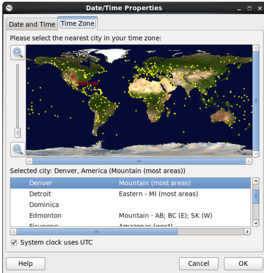
Figure 4-2: Date/Time Properties Dialog Box

The Date/Time Properties dialog box opens.