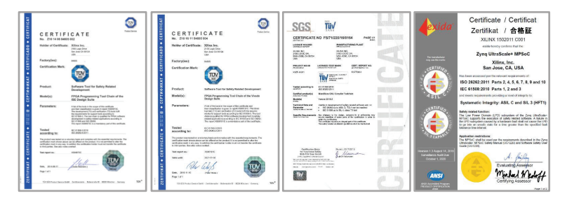
Xilinx's certified toolflows and devices