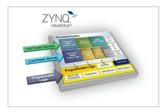
Xilinx's Zyng UltraScale+ MPSoC Overview