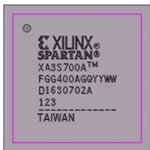
Current CGM marking