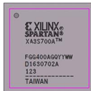
New CGM marking (For XA & XQ only)